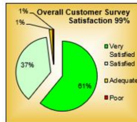
DAP – Customer Survey Results First six months of 2021/22

We seek feedback from customers from all sectors. An extract from some of the feedback received since June is shown below:-